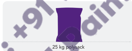
25 kg polysack

Shelf life: 3 years from date of manufacture in original tightly closed containers away from direct sunlight and excessive heat.