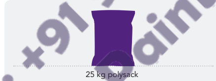
25 kg polysack

Shelf life: 3 years from date of manufacture in original tightly closed containers away from direct sunlight and excessive heat.